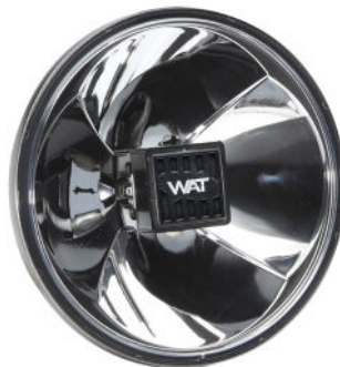
LANDING LIGHT P46PRO