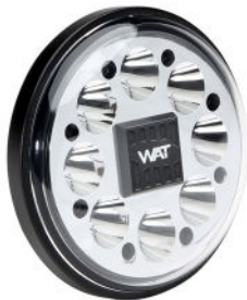
LANDING LIGHT P36PRO