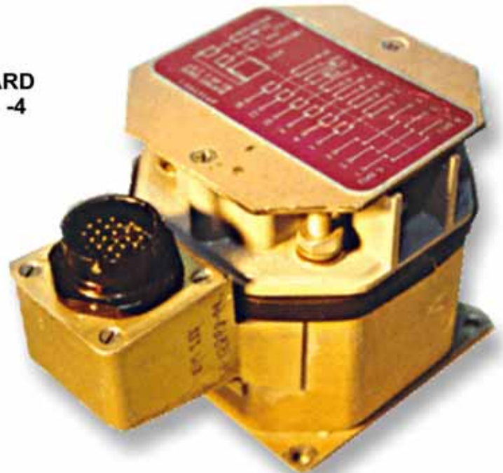
POWER RELAY P/N 941D335-4 FITTED TO BOEING 737 AIRCRAFT